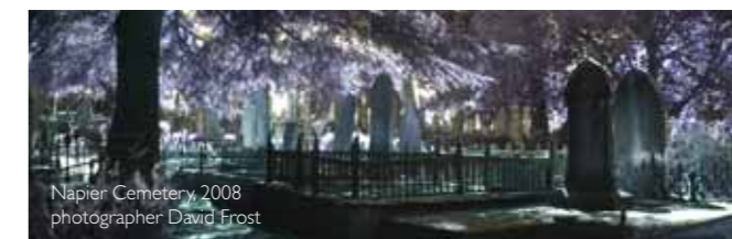
Napier Cemetery, 2008

These are being run regularly on Sundays at 2pm. Adult $5, Children Free. Bookings essential. Ph 06 835 7781