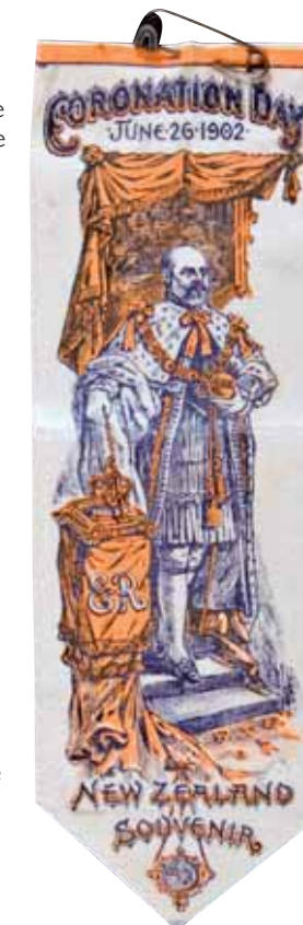
Coronation Day Ribbon, 1902 Collection of Hawke's Bay Cultural Trust, gift from unknown donor