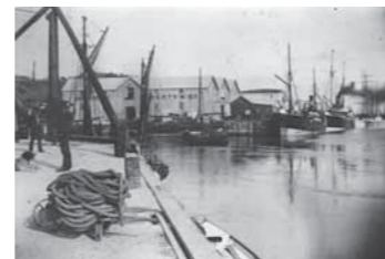
Wharf Port Ahuriri, c.1890s.

We are about to begin another exciting project to catalogue our collection of Daily Telegraph negatives which covers the years 1960 to 1996. This project is also funded by the HBRC.