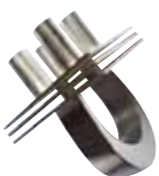
LIKE has been generously supported by Creative New Zealand.

LIKE , curated by Nelson's Stella Chrysostomou, continues at HB MAG. The exhibition presents a series of objects created by nine prominent jewellers, each of which was asked to create an object interpreting a poem written by leading poet Bill Manhire. Manhire's poem was itself a description of an original geometric object, which is displayed in the gallery alongside the nine new works. This exhibition is an intriguing display that encourages viewers to closely examine the creative process of object making.