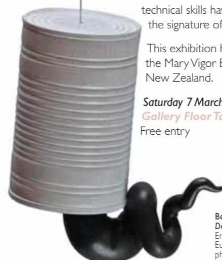
Ben Pearce Deadline (detail), English black walnut and European beech, 2008

Saturday 7 March 2009 at 2pm Gallery Floor Talk with Ben Pearce Free entry