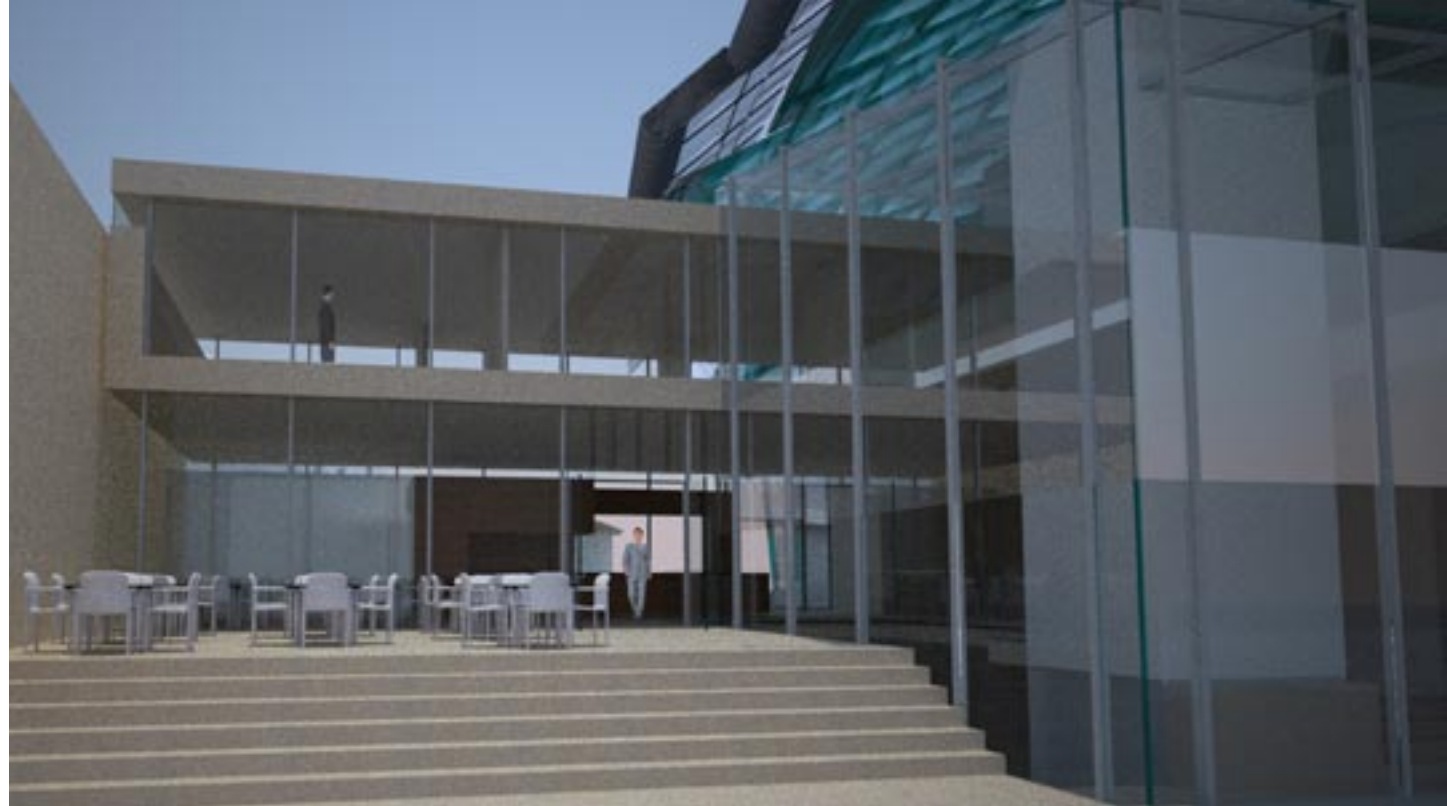
right: main entrance & cafe

This building will excite the imagination, not only the people of the Hawke's Bay but also international visitors who increasingly see the Museum & Art Gallery as an important destination when visiting the region.