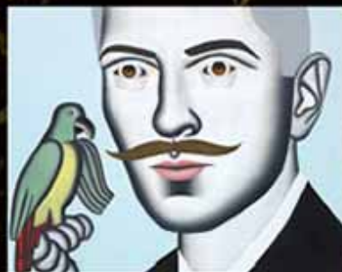
Gavin Hurley, Bless the Beast , 2006